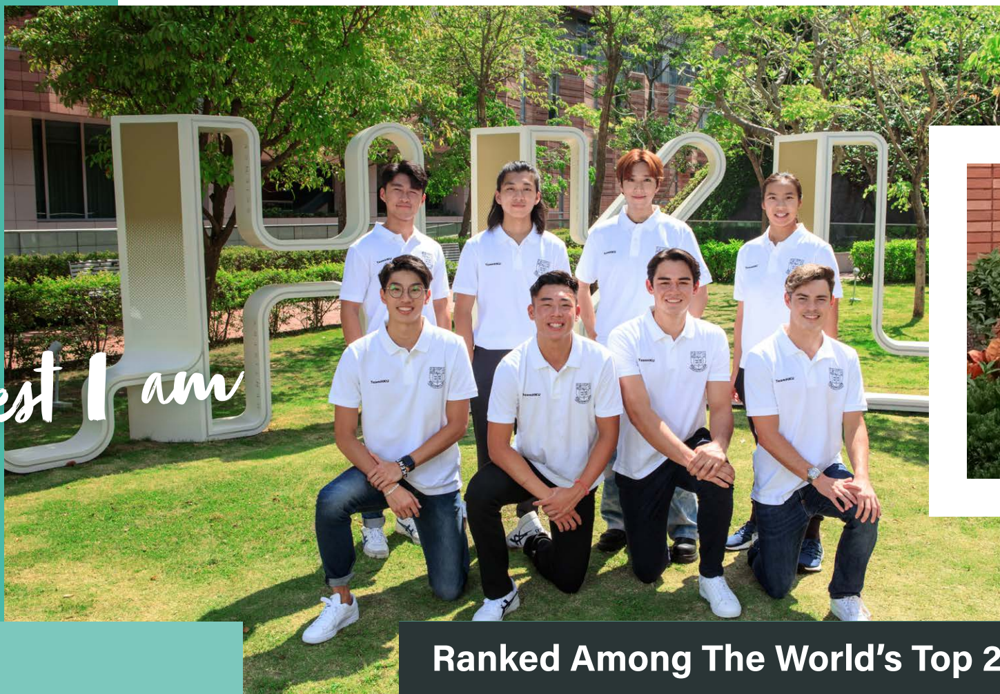
Outstanding Athletes Top Athletes Direct Admission Scheme

10 th in the world QS Graduate Employability Rankings 2022